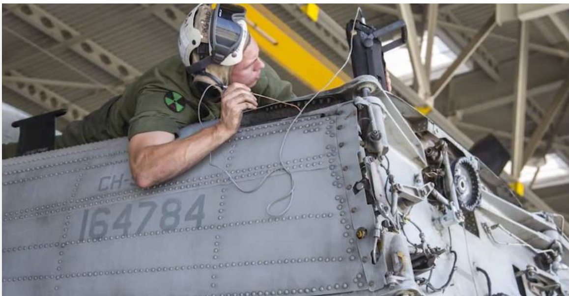
Crack Detection Around Fasteners

Use digital conductivity measurements (resistivity) to characterize/sort materials. Directly measure the conductivity of metals and alloys, such as aluminum structures, using dedicated conductivity probes that have a broad operating frequency range. Or measure a nonconductive coating such as paint. The MIZ-21C offers a wide measurement range for both conductivity and thickness.