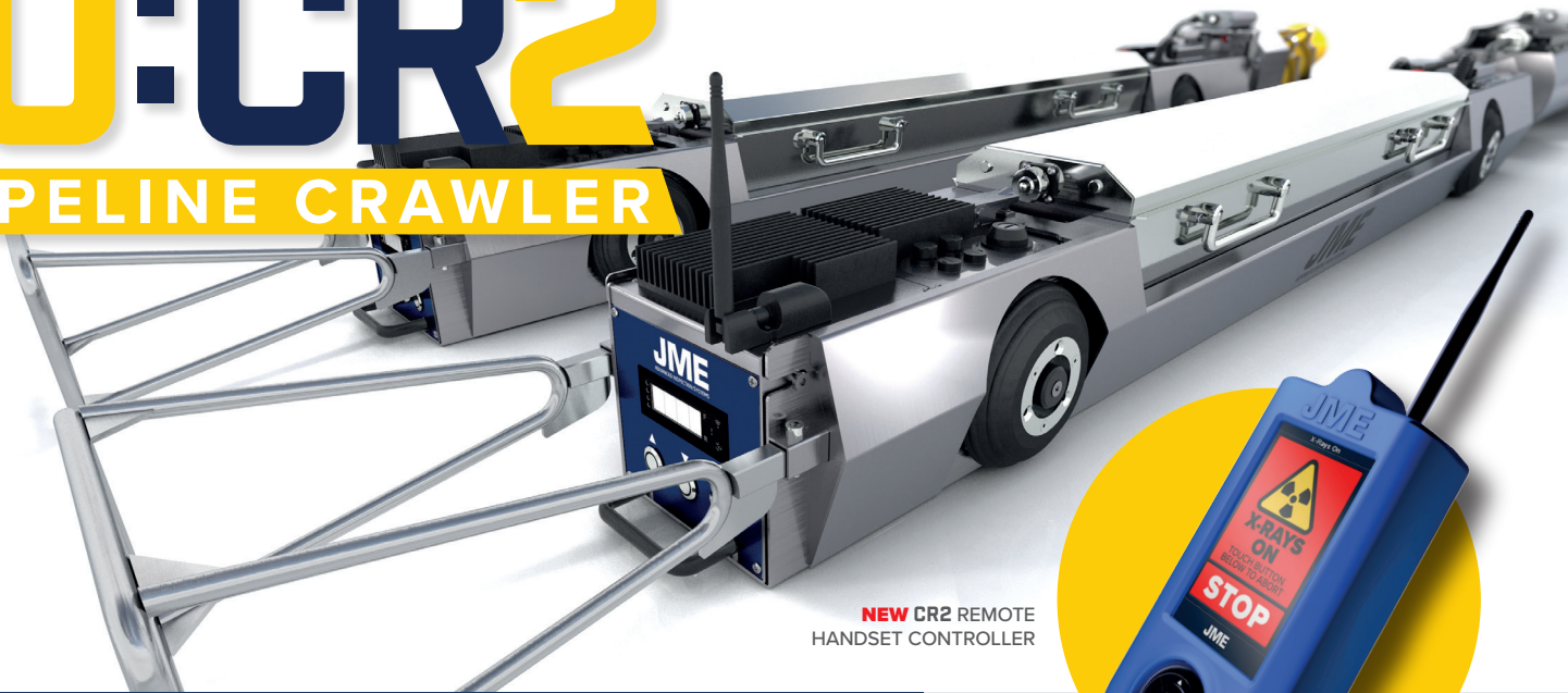
NEW CR2 REMOTE HANDSET CONTROLLER