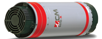
ICM SITEX 250KV - 360KV