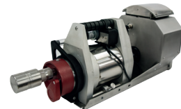
Oserix Dual 120

Pipeline dimensions are dependent on X-Ray generator